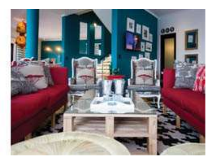
DAY 05 (FRI) SWAKOPMUND – WALVIS BAY

Enjoy a scenic morning drive along the coast to Walvis Bay for a kayak trip around the lagoon.