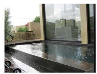
DAY 02 (TUE) WINDHOEK/SOSSUSVLEI This morning your guide will pick you up at your hotel.

Drive southwest through the scenic Khomas Hochland highlands before heading down the Great Escarpment into the Namib Desert below, stopping for a picnic lunch at a scenic location along the way. You arrive at the Sossus Dune Lodge in the mid-afternoon. If there is still time today, your guide will take you to visit Sesriem Canyon, a nearby geological attraction, or explore Elim Dune.